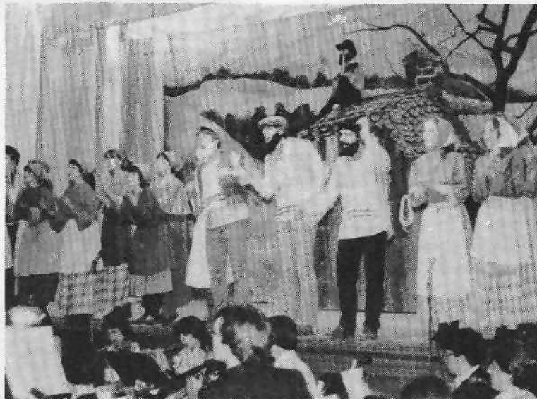
Cast members perform before one of the five large audiences to see this year's production of "Fiddler".

Recently, Archbishop Wood High Schools' fourth annual musical was presented. This year, "Fiddler on the Roof" was performed. The show was presented on April 30, May 1, 2, 7, and 9. A dinner-theater was held on Satur-